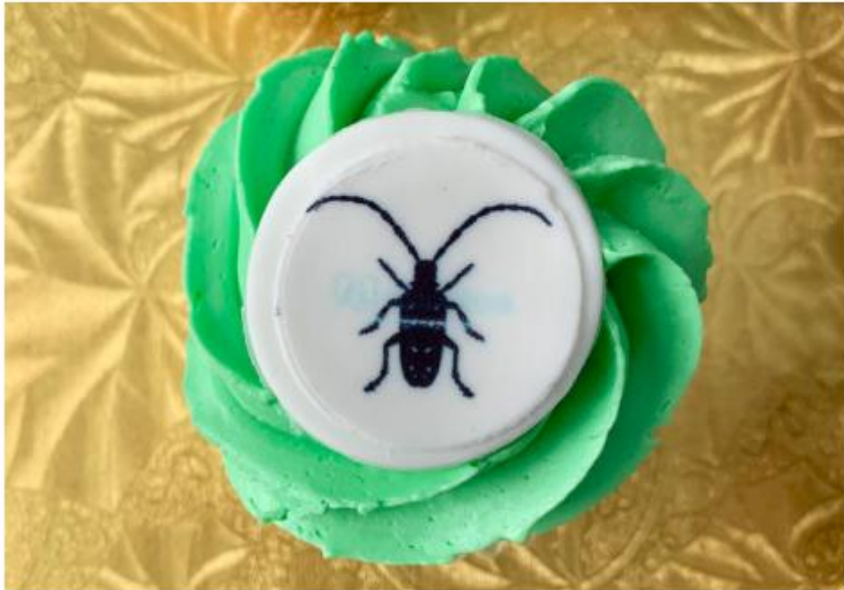
Cupcakes decorated with pictures of Asian Longhorned Beetles were served at a party on Thursday celebrating the elimination of the pests in Brooklyn and Queens.

The insect that threatened to wipe out tens of thousands of the city's trees has been squashed.