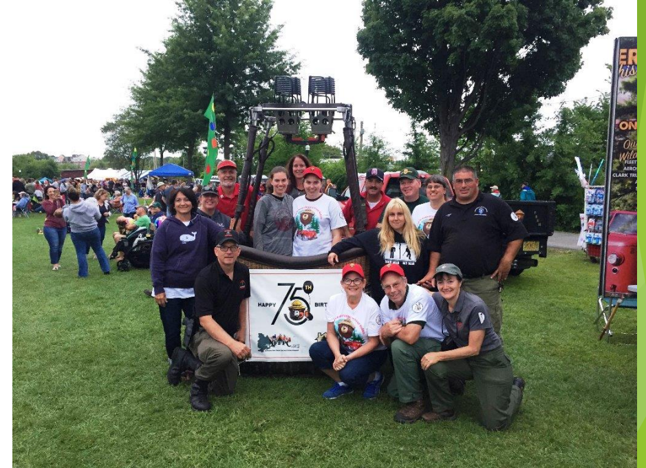
The Compact PWT booth at the Great Falls Balloon Festival in Lewiston, ME