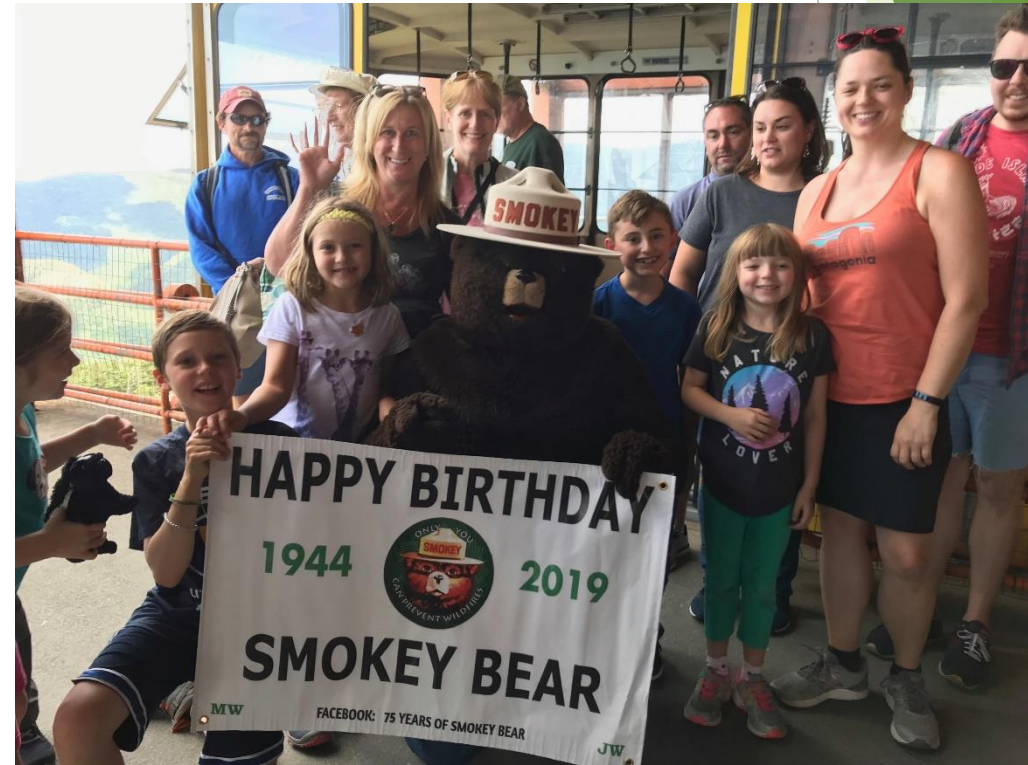
Franconia Notch State Park, NH